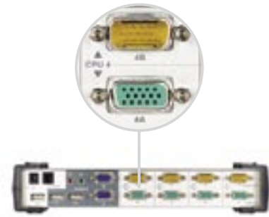
CS-1744 Rear View

The Master View Dual-View CS-1742 or CS-1744 USB KVM Switch brings dualhead video functionality to ATEN's USB KVM switch technology. Now, two (CS-1742) or four (CS-1744) dual head computers can be accessed and controlled from a single console that consists of a USB keyboard, USB mouse, and two VGA, SVGA, or Multisync monitors. In addition, the CS-1742 / CS-1744 incorporates a two port USB hub that allows each of the computers to share any USB peripherals connected to the hub.