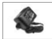
Power Adapter:DC5V x 1